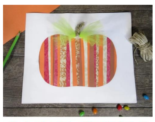
PAPER STRIPS Pumpkin