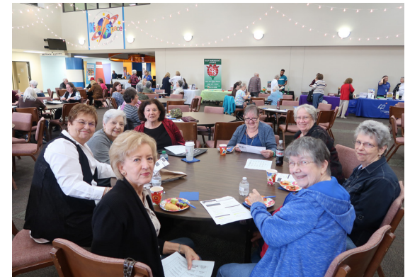
Pictured above: Caregivers attending a CarePartners' Caregiver Conference